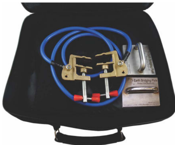
Bridging kit shown with 1.5 meter shunt cable with screw clamps & Bridging plates