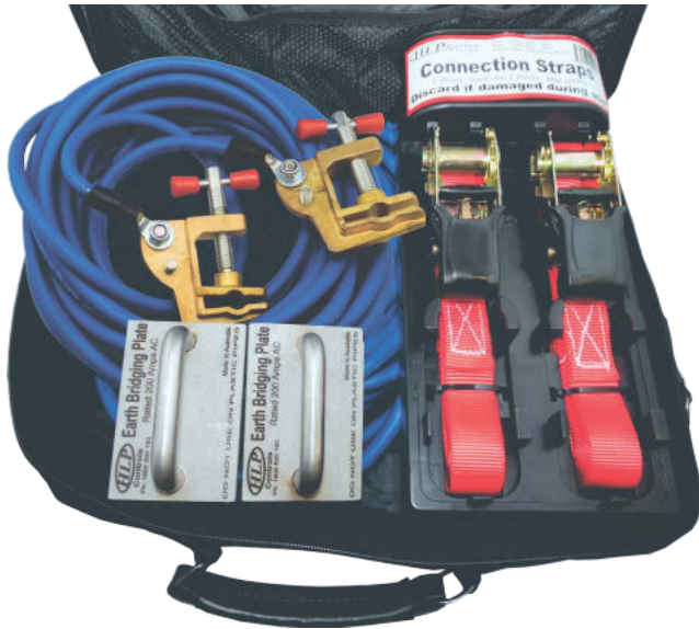
Bridging plate kit shown in the optional carry bag along with 10 meter shunt cable, screw clamps (alligator clamps also available) & ratchet straps